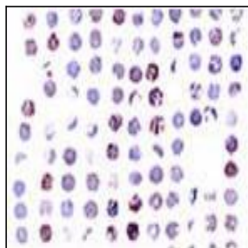
Fig:3 Formalin-fixed, paraffin-embedded section of a human colon cancer tissue microarray stained for BAX using 20-1022 at 1:2000. Hematoxylin-eosin counterstain.