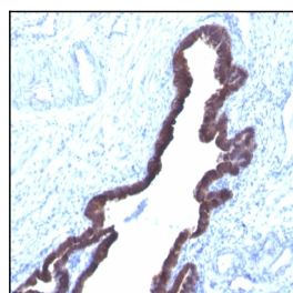
Formalin-fixed, paraffin-embedded human Ovarian Cancer stained with Cytokeratin 8/18 Monoclonal Antibody (K8.8 + DC10).

Flow Cytometry (1-2ug/million cells); Immunofluorescence (1-2ug/ml); Western Blot (1-2ug/ml); Immunohistochemistry (Formalin-fixed) (1-2ug/ml for 30 min at RT)(Staining of formalin-fixed tissues requires heating tissue sections in 10mM Tris with 1mM EDTA, pH 9.0, for 45 min at 95&degC followed by cooling at RT for 20 minutes);