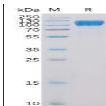
Figure 1. Human ACE2 Protein, His Tag on SDS-PAGE under reducing condition.