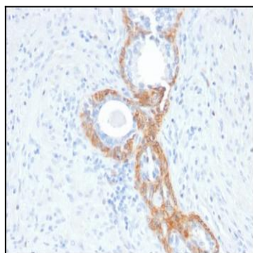
Fig. 1: Formalin-fixed, paraffin-embedded human Prostate Carcinoma stained with CK HMW Mouse Recombinant Monoclonal Antibody (rKRTH/2148).

Immunohistochemistry (Formalin-fixed) (1-2ug/ml for 30 minutes at RT),(Staining of formalin-fixed tissues requires heating tissue sections in 10mM Tris with 1mM EDTA, pH 9.0, for 45 min at 95&degC followed by cooling at RT for 20 minutes);