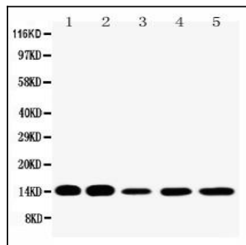
Figure 1: Anti-liver FABP antibody(39-2095). Western blotting: Lane 1: Rat Liver Tissue Lysate , Lane 2: Rat Kidney Tissue Lysate, Lane 3: HELA Cell Lysate, Lane 4: NEURO Cell Lysate, Lane 5: SMMC Cell Lysate.

Western blot : 0.1-0.5µg/ml; Immunohistochemistry(Paraffin-embedded Section) : 0.5-1µg/ml