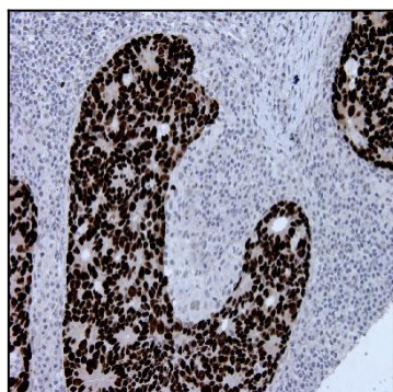
Figure-1: Colon carcinoma in lymph node Metastase section has been stained using P53 antibody (Clone: BS12) with 1:200 dilution. Carcinoma cells have strong staining reaction with nuclear staining pattern.