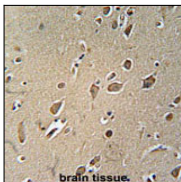
Figure 3: Immunohistochemistry analysis of NGFR Antibody (10-6534) in formalin fixed and paraffin embedded human brain tissue followed by peroxidase conjugation of the secondary antibody and DAB staining. This data demonstrates the use of the NGFR Antibody for immunohistochemistry. Clinical relevance has not been evaluated.