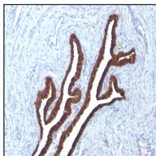
Formalin-fixed, paraffin-embedded human Ovarian Carcinoma stained with Cytokeratin 7 Monoclonal Antibody (KRT7/760 + KRT7/903)

Flow Cytometry (1-2ug/million cells); Immunofluorescence (1-2ug/ml); Immunohistochemistry (Formalin-fixed) (1-2ug/ml for 30 minutes at RT)(Staining of formalin-fixed tissues requires heating tissue sections in 10mM Tris Buffer with 1mM EDTA, pH 9.0, for 45 min at 95&degC followed by cooling at RT for 20 minutes)